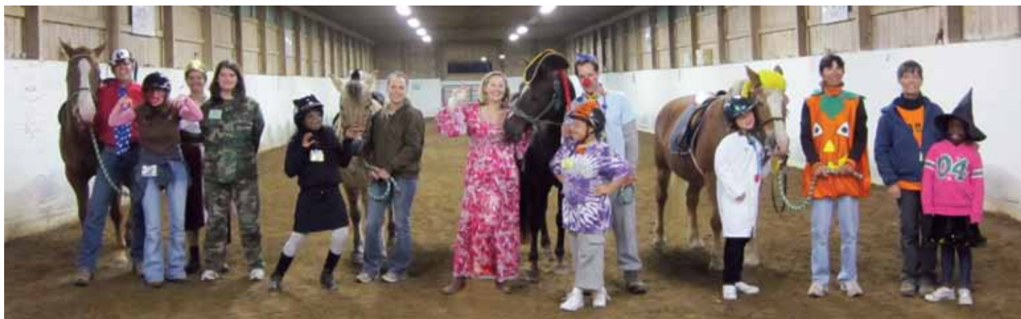
Thursday riders, volunteers, and horses getting into the Halloween spirit