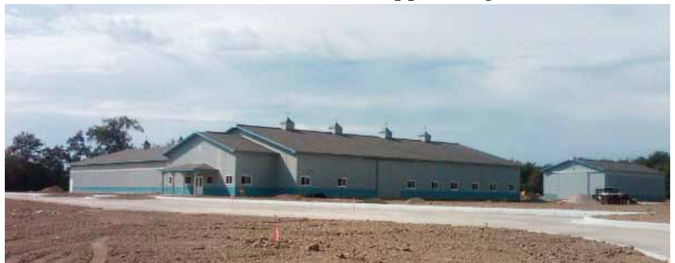
Our new home!