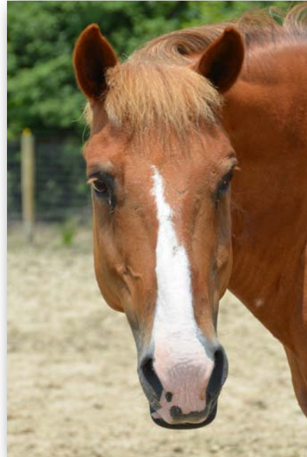
Miko our first place winner

Sigbjorn put on a burst of speed the last two weeks of the race and moved all the way up to 4 th place with $3,062.50. I think he could have finished even higher in the standings but he got distracted by some yummy reins to chew on.