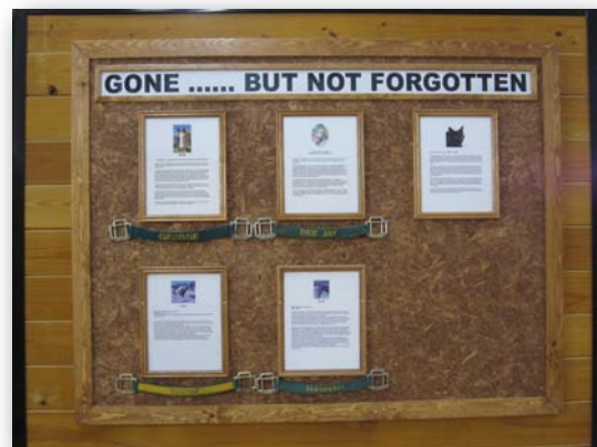
The new Gone But Not Forgotten board in the barn, gift of the McNally Family.