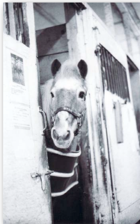
With a personality far bigger than her pony size- Star loved to have her picture taken.